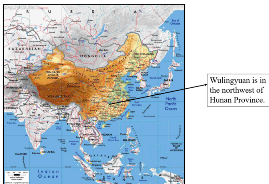
Figure 1. Location of Wulingyuan in Hunan Province, China.

Tourism development in China has long been under the control of government policy and institutional reform [41,42], which makes it an ideal area to explore tourism institutions. Wulingyuan, a district of Zhangjiajie in China, is selected as the specific case (Figure 1). It is located in the central Wuling Mountain of Hunan Province, and is comprised of four scenic areas, including Zhangjiajie National Forest Park, Tianzi Mountain Nature Reserve, Suoxiyu Nature Reserve, and Yangjiajie Nature Reserve. Notably, tourism has become the only “pillar” industry of Wulingyuan, accounting for over 90% of its GDP in recent years. Its accommodation sector mainly caters to tourists on sightseeing and leisure tours.