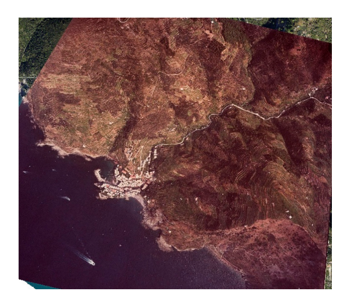
Figure 1. Coastal part of the Vernazza catchment in 1973. Almost the whole surface is terraced. The dark green areas were olive groves.