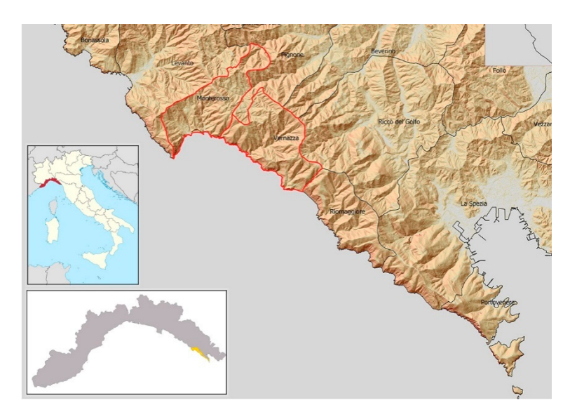
Figure 2. The red boundaries identify the two municipalities of Monterosso and Vernazza, located along the coast of Liguria, in the northern part of the Cinque Terre district.

The Cinque Terre area is located along the coast of Liguria Region, in Northeastern Italy (Figure 2), and owes its importance not only to its productive viticulture, but also because it is part of a National Park and of a UNESCO World Heritage site. Therefore, it is especially important to assess what happened, not only to prevent future damages, but also in consideration of the global significance of the area (Figures 3 and 4).