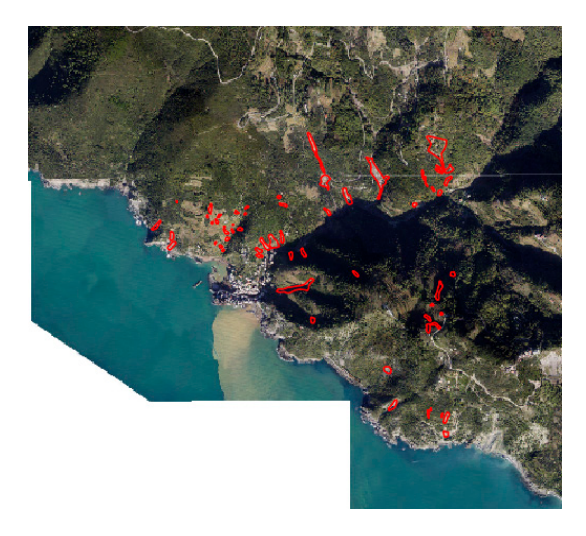
Figure 6. The same area of Figure 1 on November 2011 after the rainfall event of 25 October 2011. The landslides are emphasized in red. It's clear how woodland substituted agriculture in the last 40 years.