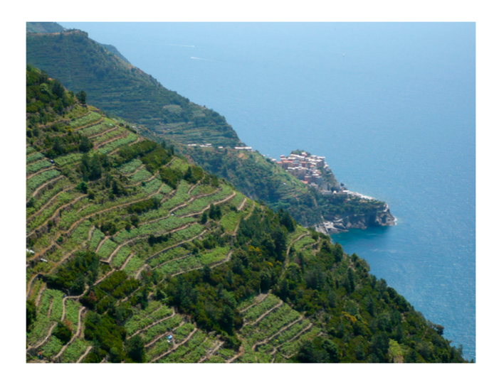
Figure 3. In the Cinque Terre area, terracing, besides having great historical and aesthetic value, plays a fundamental role in agricultural production and in the reduction of hydrogeological risk.

fine sandstones turbidites, and silty marl and siltstone [36]. These units are part of a wide, overturned antiform fold with the axis striking 150 N [37].