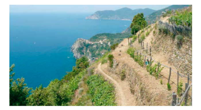
Figure 4. Terracing models the slopes of Cinque Terre, preserving many traditional practices not only as regards building materials, but also grape-growing techniques.

Figure 3. In the Cinque Terre area, terracing, besides having great historical and aesthetic value, plays a fundamental role in agricultural production and in the reduction of hydrogeological risk.