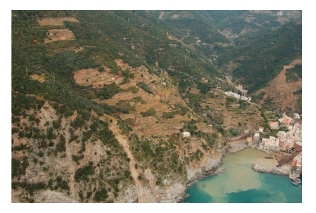
Figure 5. The settlement of Vernazza. The picture highlights the magnitude of the landslide that dragged solid material all the way down to the sea.

To provide a short overview of the consequences of land abandonment on landslide risk a simple analysis of the landslide distribution in the Vernazza area was carried out, focusing on the differences in land use. In particular, land use was categorized in three classes. (a) 'Succession on terrace', which includes all terraced areas in which cultivation activities ceased, and is currently substituted by both wood and shrub cover; (b) 'Cultivated terrace', which includes all areas which are still under any kind of cultivation, from olive groves, to vineyards, to other crops; (c) 'Vegetated natural slopes', which refer to those areas covered by spontaneous vegetation which have never been terraced. Landslide mapping was made through the photointerpretation of aerial imagery taken immediately after the event. The choice to investigate only wider failures was motivated by the fact that landslides smaller than 100 m<sup>2</sup> can have different micro-scale causes, which are not the object of this study. The land use of each failure was assigned according to the one observed at the head scarp of each landslide.