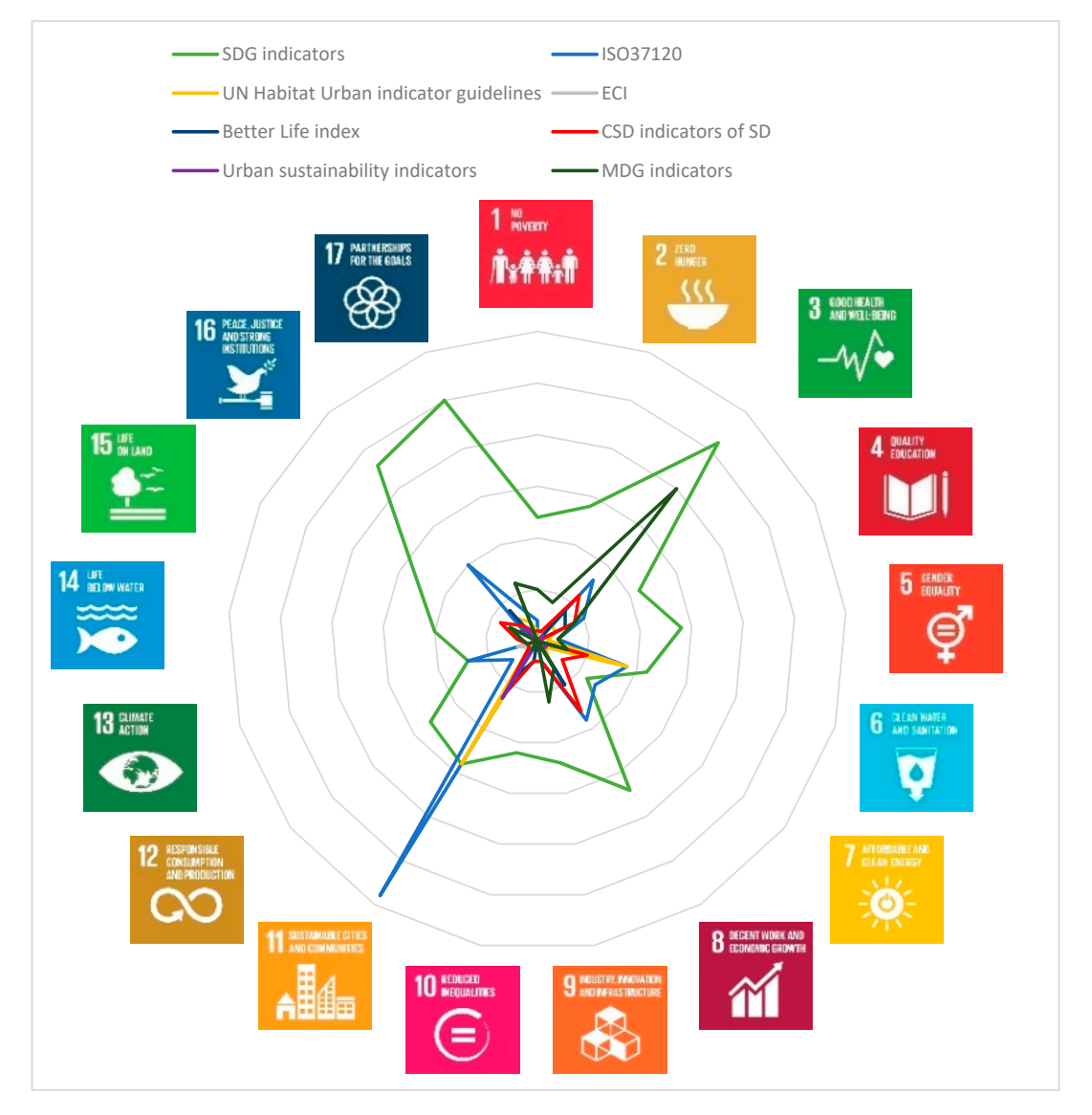
Figure 2. Number of indicators in different sustainability assessments according to SDG structure.

efficient running of a city, although the standard still claims to centre on evaluating the sustainability of cities.