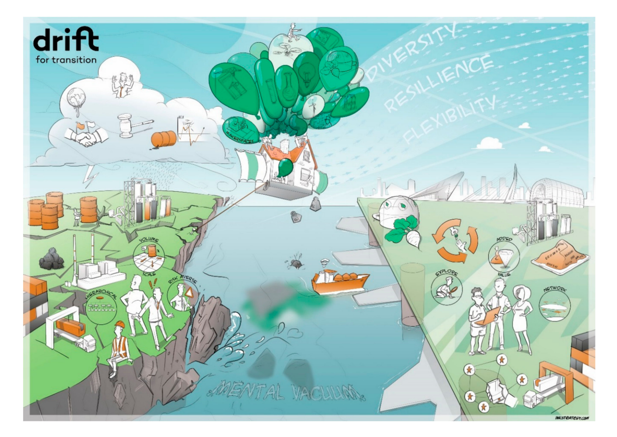
Figure 4. The visualisation of the Transition agenda 'towards a diverse, flexible and resilient Port of Rotterdam' (in cooperation with InkStrategy).

The transition arena subsequently agreed that a transition shadow track should support the internal transition within the Port Authority, as well as the transformation of the whole port of Rotterdam (see Table 2). Within this track, experimentation can take place on a small scale, to find