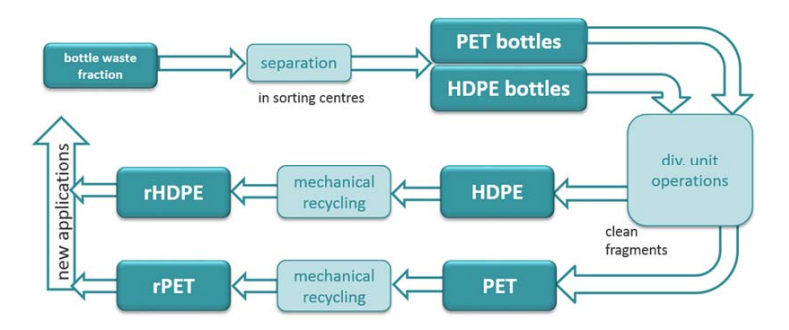
Figure 2. High-level overview of the unit operations from bottle collection to recyclates of polyethylene terephthalate (PET) and high-density polyethylene (HDPE).