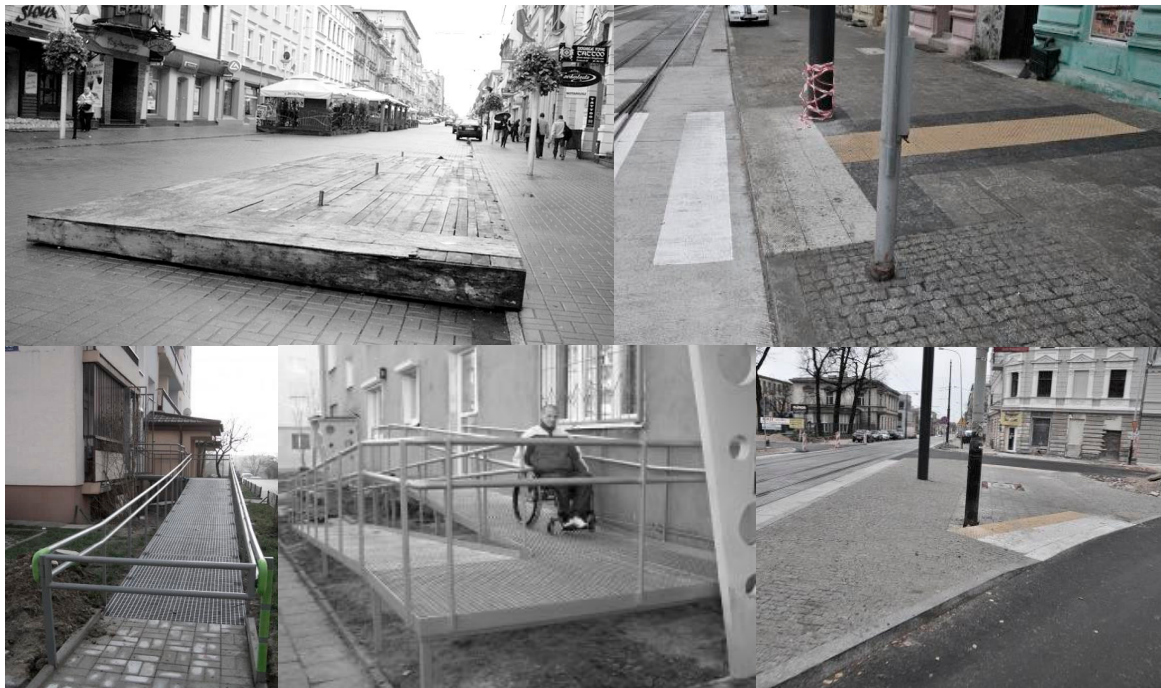
Figure 1. Examples of the existing barriers in Lodz which are particularly oppressive and stigmatizing.