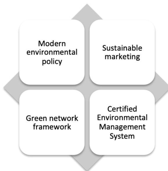
Figure 2. Benchmarking the sustainable Renewable Energy SMEs.

adoption of sustainability and integrating reporting, the stake-holder integration in environmental issues and the ISO 14001 certification of all parties [73].