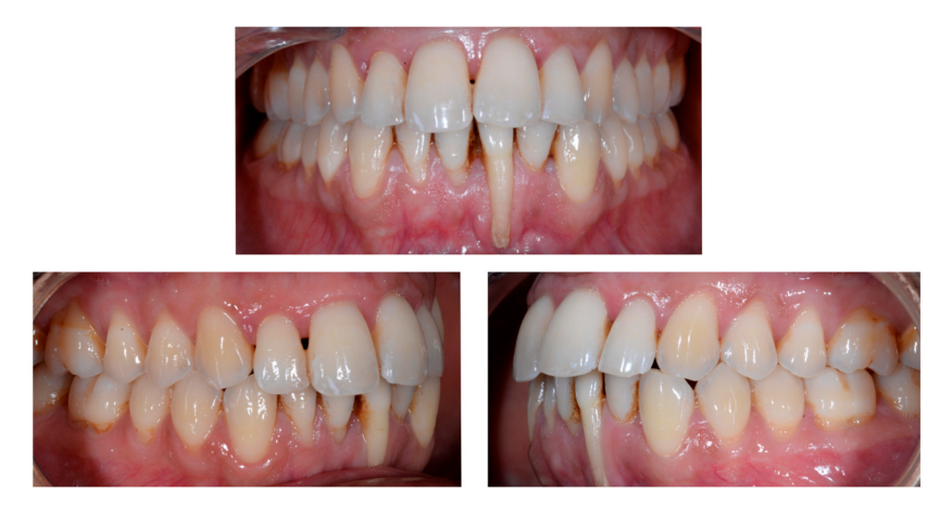
Figure 11. Severe wire syndrome. Frontal and lateral views.

A 40-year-old patient presented with discomfort in tooth 31, citing past orthodontic treatment. As shown in Figure 11, the patient was in Class I and had poor oral hygiene associated with the presence of calculus in the incisivo-canine region. The root of 31, visible to its apex, was out of the bone and associated with severe gingival recession (Cairo RT2). Teeth 41 and 42 also showed gingival recession (Cairo RT2 and RT1).