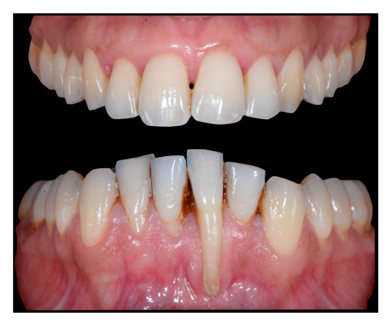
Figure 12. Severe wire syndrome. Frontal view.