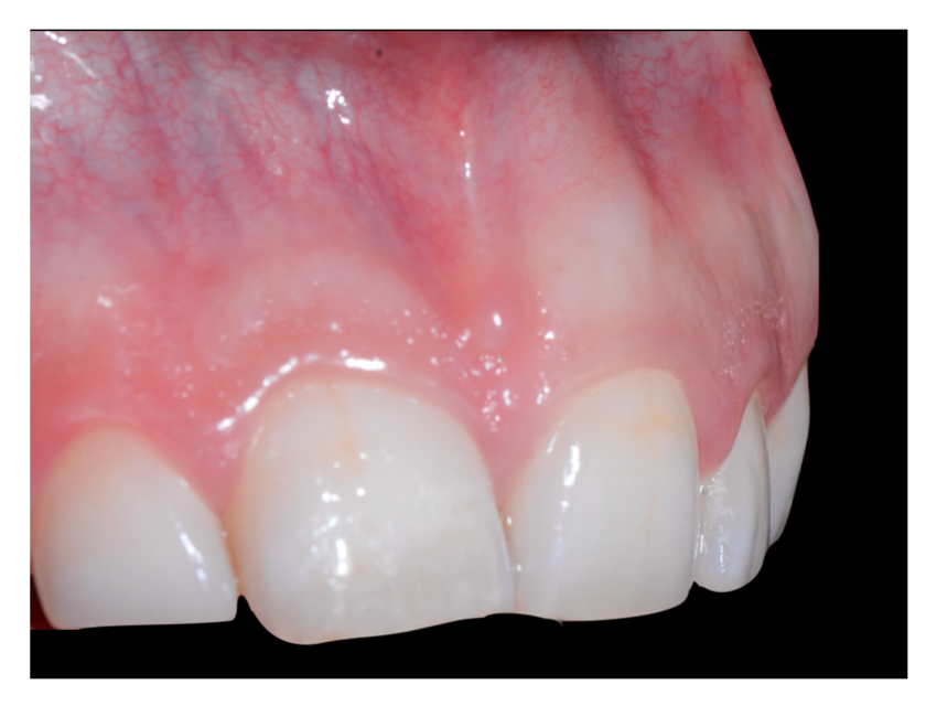
Figure 7. Intermediate wire syndrome. Lateral view.