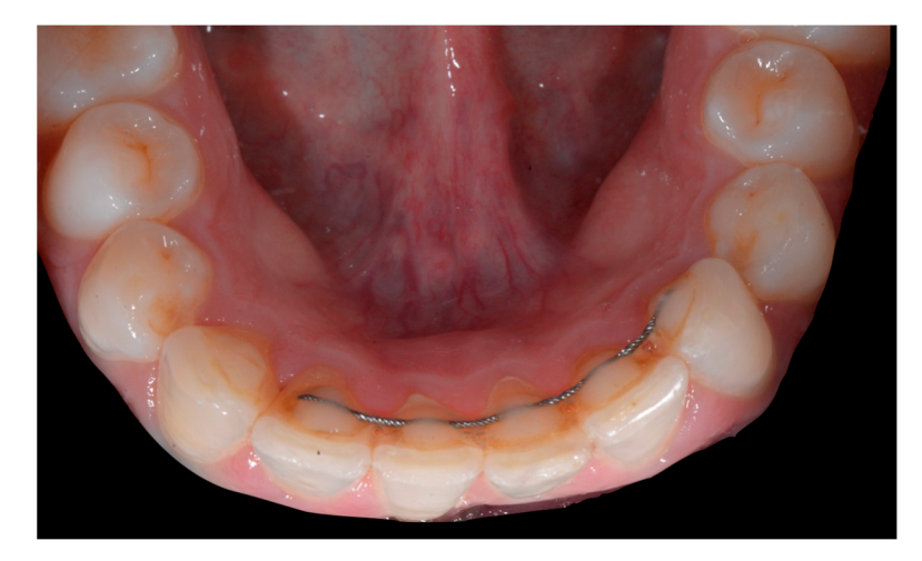
Figure 10. Intermediate wire syndrome. Occlusal view.

In the mandible, the retainer was broken distal to 42 and, despite being intact on 33, this tooth had increased visibility of its vestibular surface compared to its contralateral tooth (differential torque). Finally, teeth 31 and 41 also showed a difference in the visibility of their vestibular surfaces (differential torque). Ultimately, the patient was diagnosed with an X-effect wire syndrome on 21, an X-effect wire syndrome on 41, and a Twist-effect wire syndrome on 33.