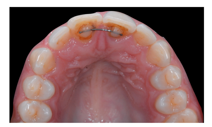
Figure 9. Intermediate wire syndrome. Occlusal view.

The occlusal views provide additional relevant information (Figures 9 and 10). A maxillary retainer was present on 11 and 21 only and a difference in visibility of the vestibular surfaces (differential torque) on these same teeth was noted.