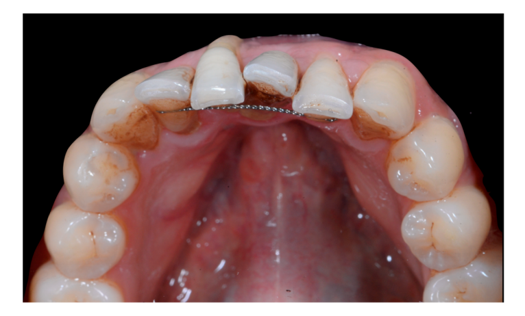
Figure 14. Severe wire syndrome. Occlusal view.

No retainer was present in the maxilla, only a residual mandibular retainer, still bonded to 32 and 42, was visible (Figure 14), as well as incisal crowding and a difference in the visibility of the buccal and root surfaces of 41 compared to the contralaterals. In this extreme clinical situation, a severe and terminal wire syndrome on tooth 41, the "X-effect" type, was observed.