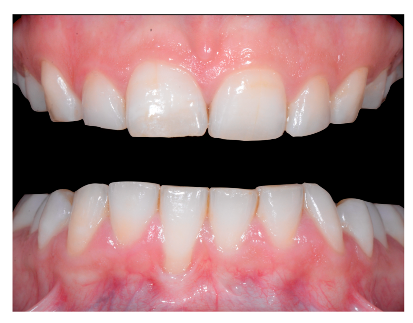
Figure 6. Intermediate wire syndrome. Frontal view.

In Figure 6, 11 and 21 show a difference in incisal edge height and gingival margin. Tooth 41 shows gingival recession to the muco-gingival junction (Cairo's RT1) with root visibility. Tooth 33 had a significant lingual tilt (coronal–lingual torque), not symmetrical to tooth 43.