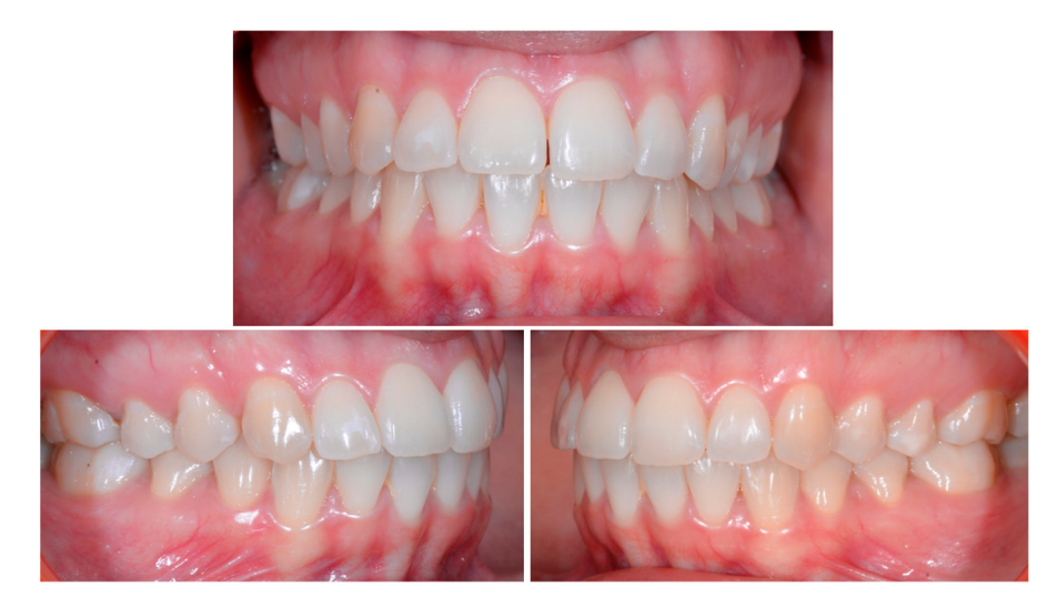
Figure 1. Early wire syndrome. Frontal and lateral views.

A 22-year-old female patient in good health had a consultation because she was concerned about the "root prominence" of tooth 41. She wore a mandibular retainer wire when she was 16 years old at the end of her orthodontic treatment. She has good oral hygiene, despite the presence of tartar between 31 and 41, and a right and left Class I with a slight deviation of the midlines (Figure 1).