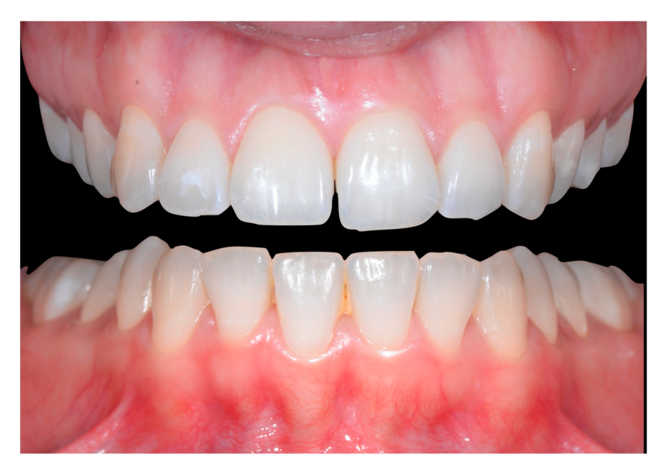
Figure 2. Early wire syndrome. Frontal views.