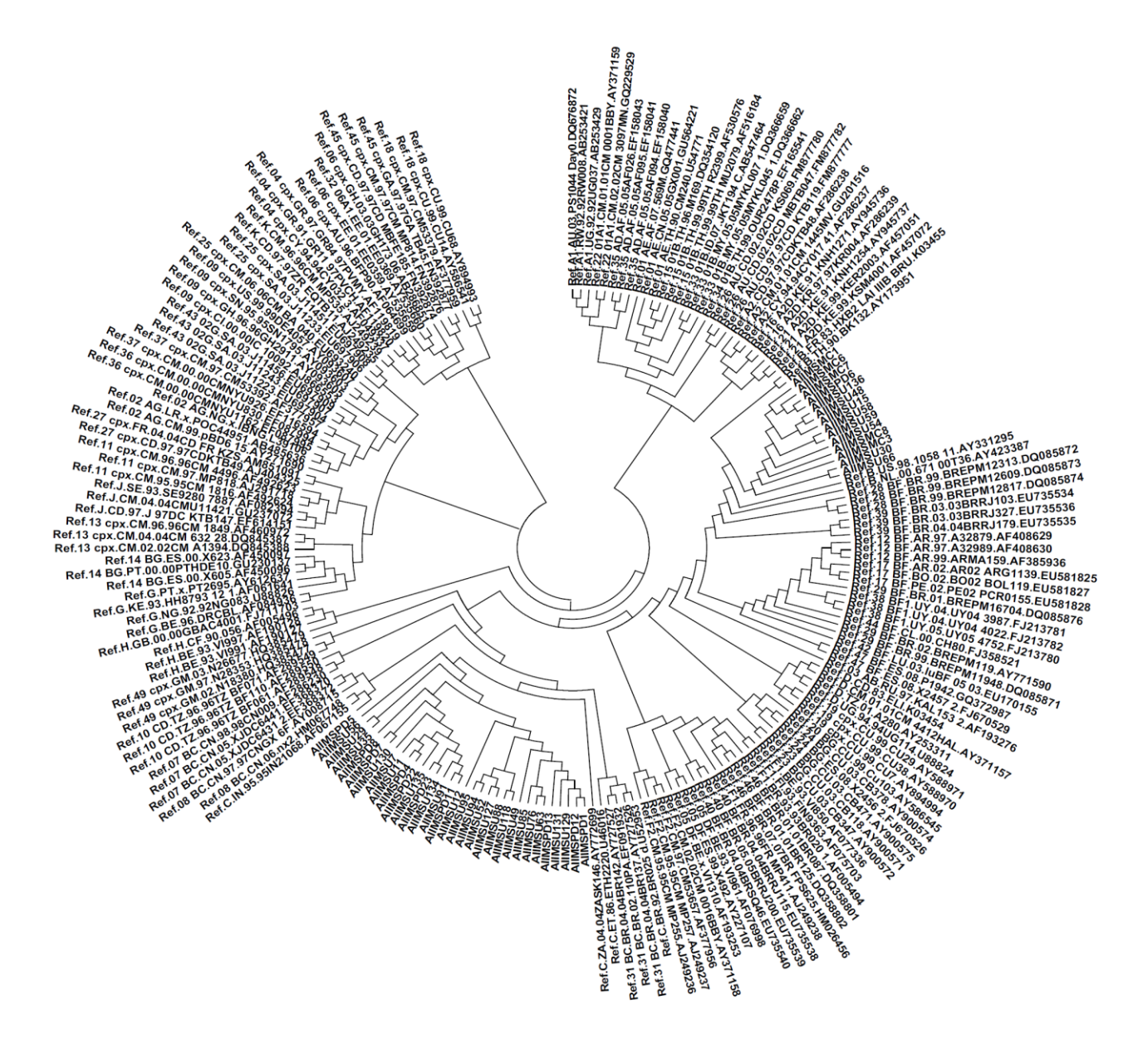
Figure 2. Neighbor-joining phylogenetic tree of Reverse Transcriptase sequences obtained from HIV-1 infected Indian children. A phylogenetic tree was constructed using MEGA 4.0 software using the neighbor joining method with 1000 bootstrap replicates. The sequences obtained from studied patients are labeled as AIIMS. 32 out of 46 RT sequences aligned with clade C while 14 aligned with subtype B sequences.

Of the total fifty-three PR sequences, thirty-three (63%; Figure 3) clustered with HIV-1 subtype C, while 19 sequences (36%) aligned with subtype B sequences. Interestingly, the protease sequence from one antiretroviral naïve patient (AIIMSU40) aligned closely with a subtype A reference sequence.