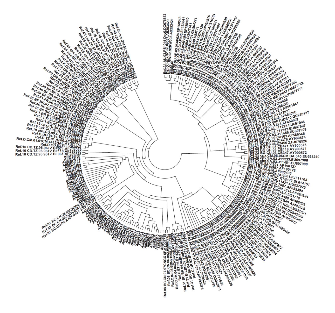
Figure 3. Neighbor-joining phylogenetic tree of Protease sequences obtained from HIV-1 infected Indian children. A phylogenetic tree was constructed using MEGA4.0 software using the neighbor joining method with 1000 bootstrap replicates. The sequences obtained from studied patients are labeled as AIIMS. 33 out of 53 PR sequences aligned with clade C while 19 aligned with subtype B sequences. PR sequences of AIIMS40 aligned with subtype A viral sequence.

The antiretroviral regimen for the HIV-1 infected pediatric group included a combination of two NRTIs (Lamivudine with zidovudine or Stavudine) and 1 NNRTI (Nevirapine or Efavirenz). In the present study, analysis of the viral RT gene sequences from the thirty ART naïve HIV-1 infected pediatric patients using the Stanford HIV drug resistance database revealed that nine (30%) had major drug resistance mutations for NRTI and NNRTI drugs (Table 3). Among ART treated pediatric patients, seven of the total nineteen (37%) harbored major drug resistance mutations for NRTI and NNRTI drugs (Table 3).