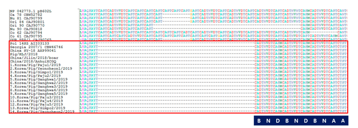
Figure 3. Central hypervariable region (CVR) analysis of ASFV isolated in domestic pigs of South Korea, 2019. Code as labeled in previous studies; [6]. A = CAST, CVST, CTST, or CASI; B = CADT, CADI, CTDT, or CAGT; D = CASM; N = NVDT, NVGT, NVDI, or NCDT.

The TRS insertion in the IGR of MGF 505 9R/10R is a new marker of genetic variation among ASFV of genotype II [5]. There are two types according to the insertion: MGF-1 type without insertion and MGF-2 type with a new long insertion of 17 nucleotides (GATAGTAGTTCAGTTAA). MGF-2 type has