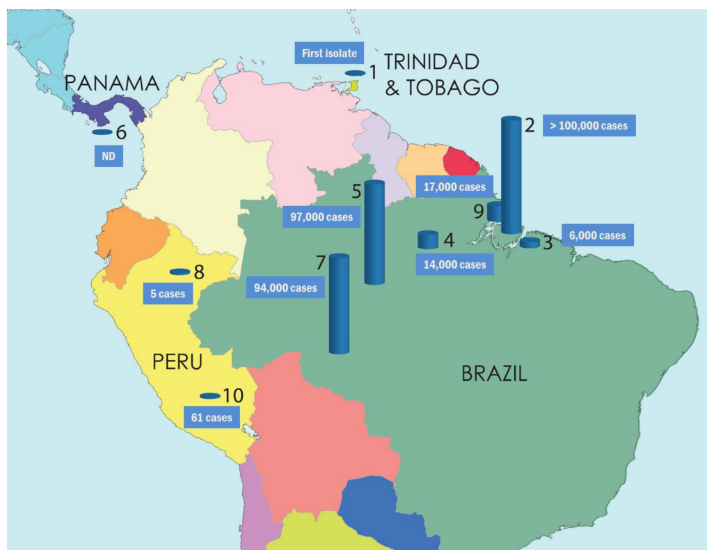
Figure 3. The spread of OROV in Central and South America from 1955 to 2016 (Bar symbols represent the affected populations in different geographical locations, and the estimated or confirmed number of infected individuals in several outbreaks). 1—Trinidad and Tobago, 1955 first isolated (one case); 2—Belém, Pará, Brazil, 1961 first epidemic (11,000 cases), 1979–1980 epidemic (>100,000 cases); 3—Bragança, Pará, Brazil, 1967 epidemic (6000 cases); 4—Santarém, Pará, Brazil, 1975 epidemic (14,000 cases); 5—Manaus, Amazonas, Brazil, 1980–1981 epidemic (97,000 cases); 6—Panama, 1989 first epidemic (N.D: no data); 7—Ariquemes and Ouro Preto do Oeste, Rondônia, Brazil, 1991 epidemic (94,000 cases); 8—Iquitos, Peru, 1992 first epidemic (five confirmed cases); 9—Magalhães Barata & Maracanã, Pará, Brazil, 2006 epidemic (17,000 cases); 10—Cusco, Peru, 2016 last reported epidemic (61 cases).

The emergence and re-emergence of OROV fever in Central and South America have resulted in more than 30 epidemics in Brazil, Peru, Panama, and Trinidad and Tobago, the majority being reported in Brazil, with disease prevalence to be 20% in both urban and rural human populations of the affected regions (Figure 3) [46–48]. OROV is the second most frequent arbovirus in Brazil after dengue virus and among 200 different arboviruses isolated in this country [49,50], with considerable social and economic impact. It is estimated that over half a million of people have been infected by OROV in over 60 years, but it is likely the actual number of cases to be higher since many of them may go undiagnosed or misdiagnosed due to similar clinical manifestations with other febrile diseases caused by other arboviruses (e.g., dengue, West Nile, yellow fever, Zika, chikungunya, Guama, Mayaro) co-circulating in the endemic regions [5,48,51,52].