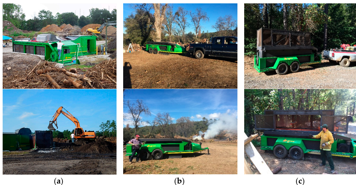
Figure 1. The Air Curtain Burners used to test burning of forest residues in (a) S-220 in Jacksonville, Florida; (b) BurnBoss in Groveland, California; and (c) BurnBoss installed with ember screen in Volcano, California. The loader is used to load the forest residues in S-220 operation while BurnBoss operation is loaded by hand.

An alternative technology to dispose of forest residues is to use an Air Curtain Burner (ACB), which is designed by Air Burners Inc., Palm City, FL, USA (also called as Air Curtain Destructor or Incinerator; Figure 1). ACBs are divided into two main types, stationary (positioned at the centralized landing area) and mobile applications (half-ton pick-up truck mounted system). These machines were developed in compliance with US Environmental Protection Agency's 40 Code of Federal Regulation Part 60 regulation that determines allowable emissions from biomass burning [19,20].