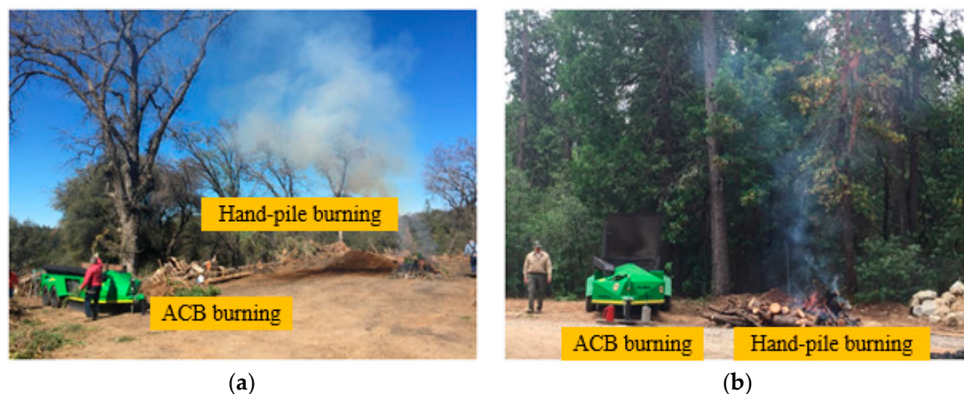
Figure 4. Comparison of the smoke occur from BurnBoss and hand-pile burning for the same types of forest residues; (a) Groveland and (b) Volcano, California. BurnBoss burnings shows little smoke and air pollutants, compared to hand-pile burnings.