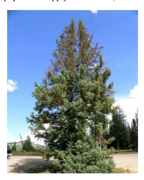
Figure 4. Engelmann spruce topkill due to inadequate height coverage on the tree bole using ground application equipment to apply insecticide.

Applied correctly, failures in efficacy are rare. However, when failures occur, they are often associated with inadequate coverage, improper mixing, improper storage, and/or improper timing ( i.e. , applying treatments to trees already successfully attacked by spruce beetle) [178]. Removing obstructing limbs on the lower portion of the tree bole will improve treatment efficacy. Larger diameter trees (≥50 cm dbh) are difficult to treat effectively due to spray height limitations associated with most ground application equipment. With outbreak populations of the insect, spruce beetle attacks large diameter trees above the spray height killing that portion of the tree not treated (Figure 4).