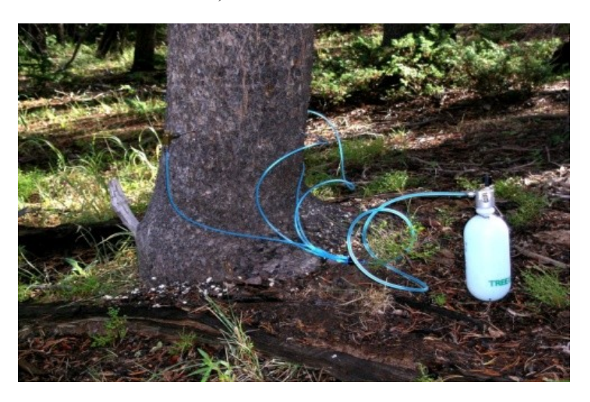
Figure 5. Arborjet Inc. injection treatment used to apply insecticide directly into the tree bole [185].

Research is ongoing in an attempt to find a safer, more portable and longer lasting alternatives to bole applied insecticides by injecting small quantities of systemic insecticides directly into the lower bole. Shea et al. [184] evaluated the effects of acephate, dimethoate, and carbofuran delivered by Medicap implants in both unattacked and attacked spruce in Alaska. Tree mortality ranged from 60%–93% percent for all insecticide treatments with 100% mortality of the control trees. The insecticide treatments were determined to be inadequate in preventing tree mortality. An experimental formulation of 4.0% emamectin benzoate injected in late August in unattacked Engelmann spruce was ineffective for protecting individual trees from spruce beetle caused mortality in Utah [185] (Figure 5). However, the commercial formulation of TREE-age<sup>TM</sup> is currently being evaluated by USDA Forest Service research entomologists and others by applying an early summer versus late summer treatment to unattacked Engelmann spruce in Utah.