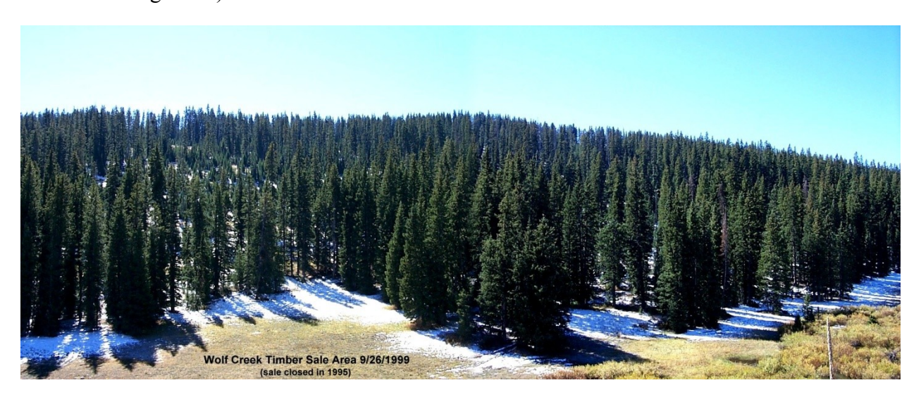
Figure 3. Residual spruce-fir stand following a spruce beetle sanitation/salvage sale, Unita-Wasatch-Cache National Forest, Utah.

In stands where susceptible host trees comprise more than the recommended percentage of basal area for desired management objectives, the following silvicultural options are possible: