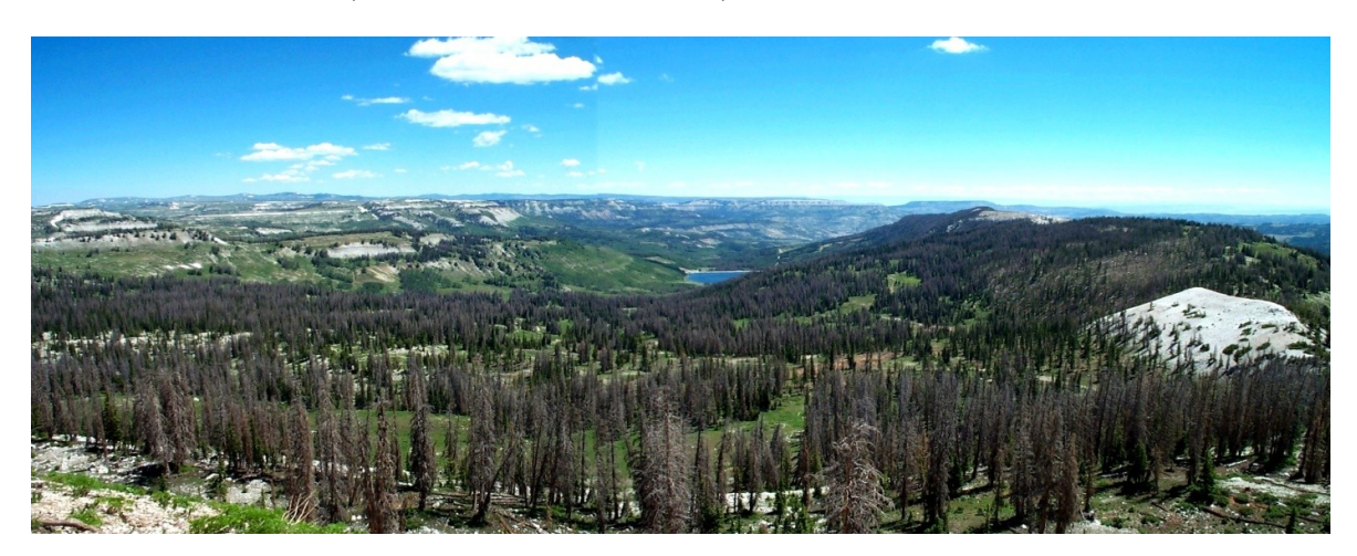
Figure 1. Spruce beetle outbreak on the Wasatch Plateau (1985–1995), Manti-LaSal National Forest, Utah.

These outbreaks have precipitated a surge in new basic and applied research aimed at clarifying our understanding and/or to fill knowledge gaps. Schmid and Frye [1] cited Wygant and Lejuene [6] who stated "all known major outbreaks originated from stand disturbances such as blowdown". Recent research, however, has shown that the mechanisms contributing to the occurrence of severe spruce beetle outbreaks are more complex. The unprecedented scale of the current outbreaks also suggests that warming temperatures attributed to climate change and the region-wide susceptibility of spruce in the spruce-fir zone have had a significant impact on outbreak occurrence [7–9].