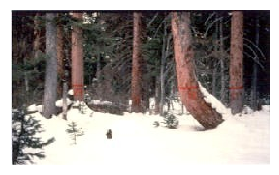
Figure 7. Standing baited Engelmann spruce trap trees marked in orange paint.

Standing trap trees baited with an attractant pheromone (tree bait) are effective at absorbing beetles, but attract fewer beetles than downed trap trees [209] (Figure 7). Baiting standing susceptible green trees with aggregation pheromones is an effective method for attracting flying beetles and inducing attack. The baits are stapled on the north side of standing, green trees prior to flight. Secondary attraction to the treated tree often develops and it is not uncommon to experience adjacent susceptible trees also attacked. Tree baits are often deployed to focus beetle attacks into sites where trees can easily be treated and/or to reduce spread from infested sites. Where possible, trees should be baited close to active spruce beetle pockets (within 30–60 m), or within the pocket. Cluster baiting appears to maximize attraction. This method consists of baiting three trees spaced 15–30 m apart in a deltoid pattern within infested pockets. Once colonized, the baited trees are removed, or treated in the same manner as trap trees during the year of attack. Baiting strategies are most effective if used in units with isolated infestations in conjunction with sanitation treatments.