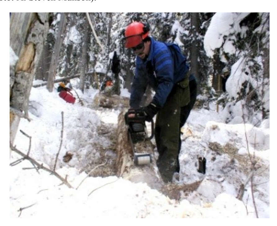
Figure 6. Log Wizard<sup>TM</sup> [211] used to peel bark from spruce beetle infested Engelmann spruce (Photo: A. Steven Munson).

Susceptible host trees adjacent to felled trap trees will often be attacked. Felling trap trees in sites comprised of non-host trees or small diameter host trees (<20.3 cm dbh) will reduce the number of spillover attacks on adjacent susceptible hosts. Trap trees not treated by the following spring before adult flight, will add to further tree mortality. To suppress beetle populations, all standing and down infested trees should be treated (burned, debarked or removed) before beetle emergence the following spring (Figure 6).