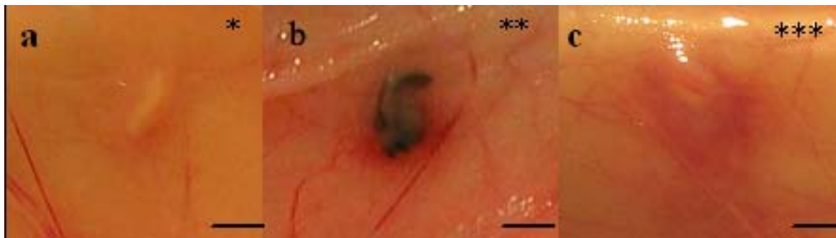
Table 2. Macroscopic appearances (graded * to ***) of all implants (see also Figure 2). Implants where the surrounding tissue shows no rubor is indicated by *, slight rubor at one pole of the implant is indicated by **, and rubor surrounding the whole implant is indicated by ***, see Figure 2 for examples. The implants are listed in the left column and the numbers (1-3) in the top row indicate the different rats. Abbreviations; C2, C3, C2M, C3M, C2MS, C3MS corresponds to different 4RepCT fibre treatments (see experimental section and Table 1).

Figure 2. In vivo macroscopic appearances (graded * to ***) of implants at explantation. The rating in Table 2 is exemplified by (A) 4RepCT, degree* (C3 from animal no 1), (B) Mersilk™, degree ** (from animal no 3), and (C) 4RepCT, degree*** (C3M from animal no 1). Scale bars are 1.0 cm.