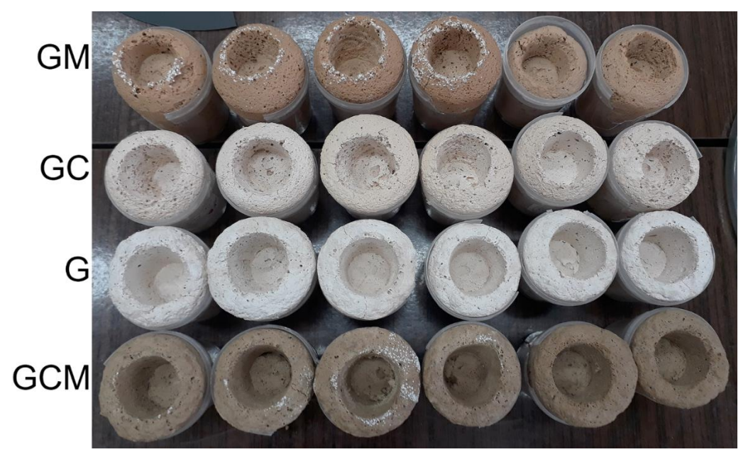
Figure S2. An efflorescence (white salt deposits) on or near the surface of pots, which were not subjected to neutralization process. Presented pots after 90 days of aging at ambient temperature and humidity.