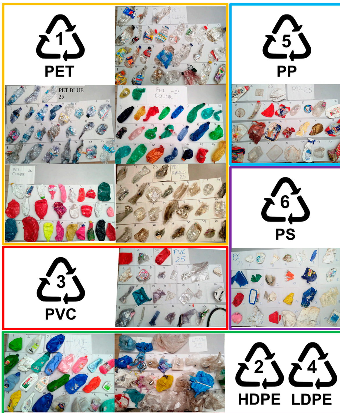
Figure S1. Systematic organization of the collected urban plastic waste for laboratory measurements.