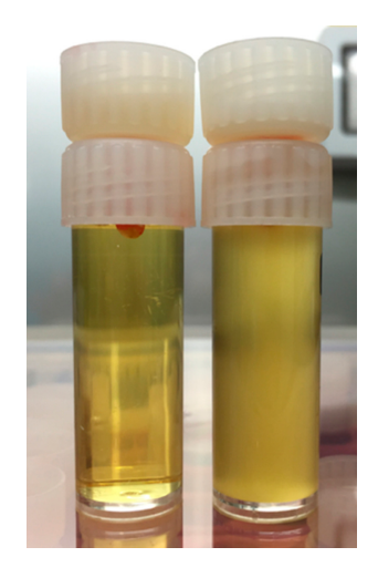
Figure 2. BHI medium in clear (left) and turbid states (right).

All 20 positive controls consisting of roots with open canals failed by the second day. None of the test materials completely resisted bacterial penetration. Ranked from best performing to worst, Supercal<sup>TM</sup> had five surviving samples at the end of 90 days, followed by Nex MTA<sup>TM</sup> with two, and Zirmix<sup>TM</sup> and MTAmix<sup>TM</sup> each with one. All AH-Plus<sup>TM</sup> samples leaked within 48 days.