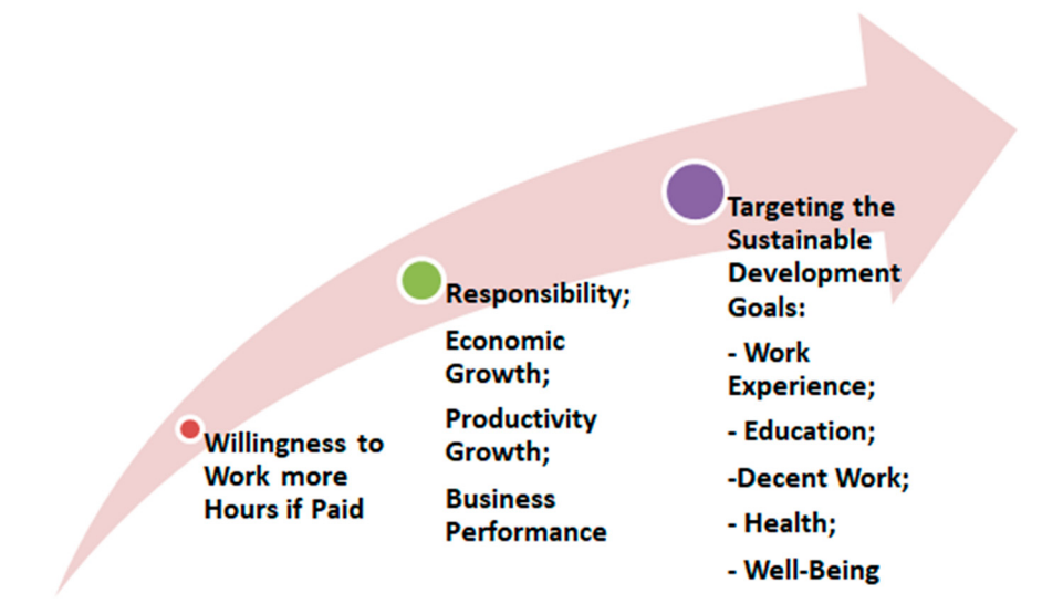
Figure 3. The effects of working more hours if paid in today's social and economic context.

crisis, in delicate situations, that require particular attention in terms of social and economic needs. In this case, individuals' desire and/or need to work more hours if paid, might have roots in different situations, such as, for instance: people's necessity to become financially independent, employees' desire to make themselves remarked through their work at their place of employment in order to have better chances to be promoted faster and in higher positions, or people's inclination to feel needed and rewarded accordingly. In conclusion, the results of this study are very interesting and, at the same time, eye-opening, since they point out some of the particularities of the labour market in the case of South Africa: for instance, based on the data analysed, being female increased the likelihood of willingness to work more hours if paid by 1.1 percentage points; also, being never married increased that probability by 2.7 percentage points; moving on, within education categories, the highest coefficient in magnitude, having tertiary education decreases the probability of willingness to work more hours by 8.2 percentage points; furthermore, as an important labour market indicator, one more year to commence working increases the probability of willingness to work more hours if paid by 0.4 percentage points (see Figure 3: The effects of working more hours if paid in today's social and economic context).