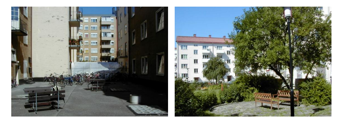
Figure 1. Examples of "quiet" courtyards in the study with low (left) and high environmental physical quality (right).