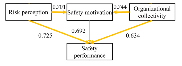
Figure 4. Structural equation modeling of SP in Hong Kong.

Path coefficients were compared to further clarify the regional similarities and distinctions of every influence path. The two versions of SEMs are shown in Figures 4 and 5. The influential intensity among safety constructs was compared between regions. With regard to the SP models, the results show that the influence mechanisms on SP in both the individual and organizational levels were stronger in Hong Kong (p < 0.005 for RPC, SMO, and OC), compared to those in Mainland China (p < 0.01 for PRC, SMO, and OC). Table 8 presents the results of the path coefficients and their corresponding significance levels. The width of the arrows in the figures reflects the intensity of the influences. Stronger effects between regions were highlighted in orange to emphasize the differences of the influence mechanism in the research model (see Figure 4).