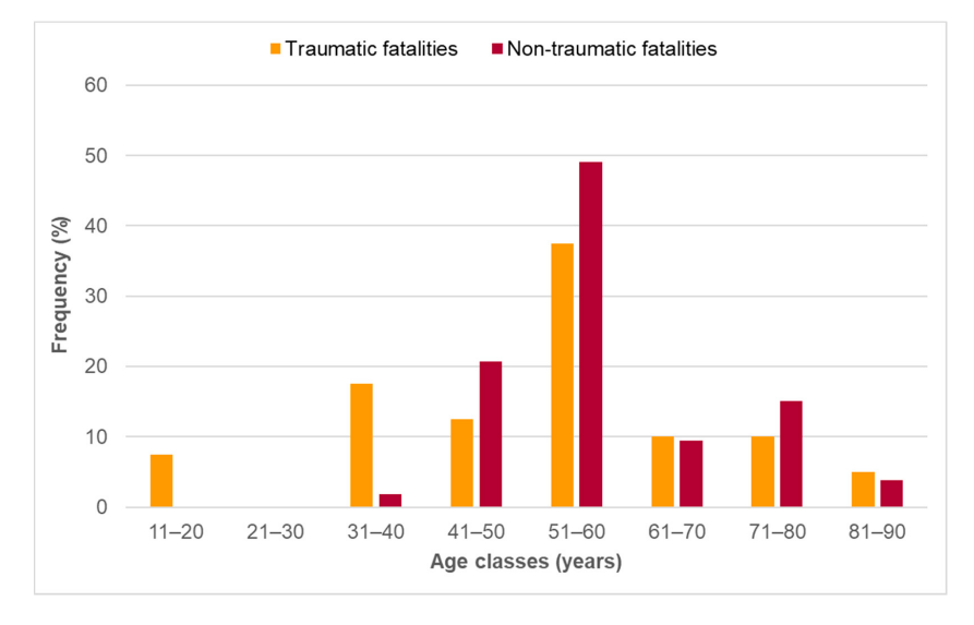
Figure 1. Overall cause of mortality during recreational MTB in the Austrian Alps in the period 2006–2021 divided by age class (n = 93). Orange columns = traumatic fatalities (n = 40), red columns = non-traumatic fatalities (n = 53). Values are relative frequencies. Significance level: p = 0.0503.

As shown in Figure 1, most of all mountain-bikers were aged between 51 and 60 years (42.3%), whereat there was a clear trend suggesting mountain-bikers accidented for non-traumatic reasons belonging more frequently to higher age classes in comparison to traumatic accidented ones (p = 0.05).