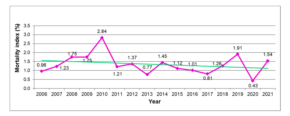
Figure 4. Mortality index (proportion of deaths/accidented victims) during recreational MTB in the Austrian Alps in the period between 2006 and 2021. Green line = trend line.