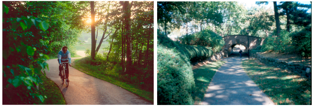
(6) Shared use path