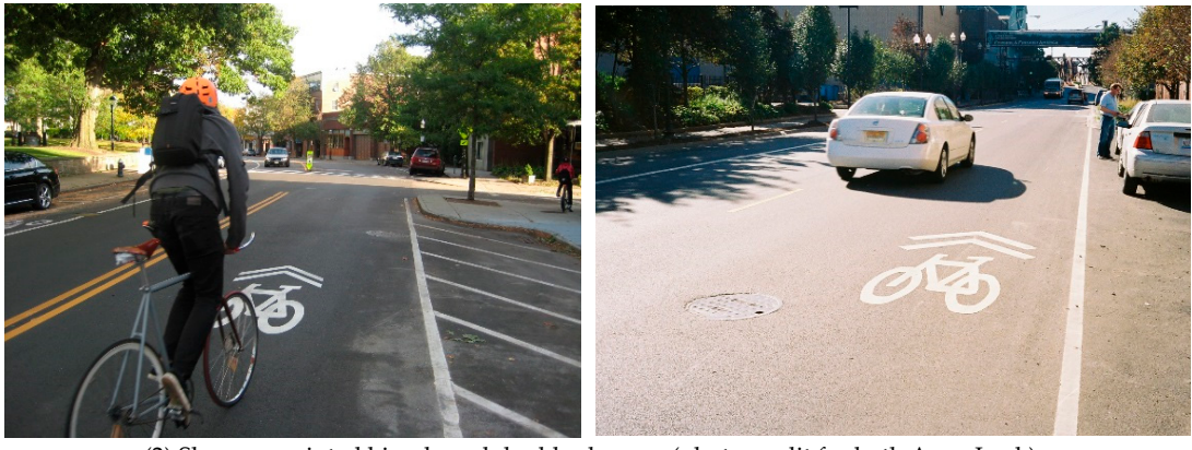
(2) Sharrow-painted bicycle and double chevron