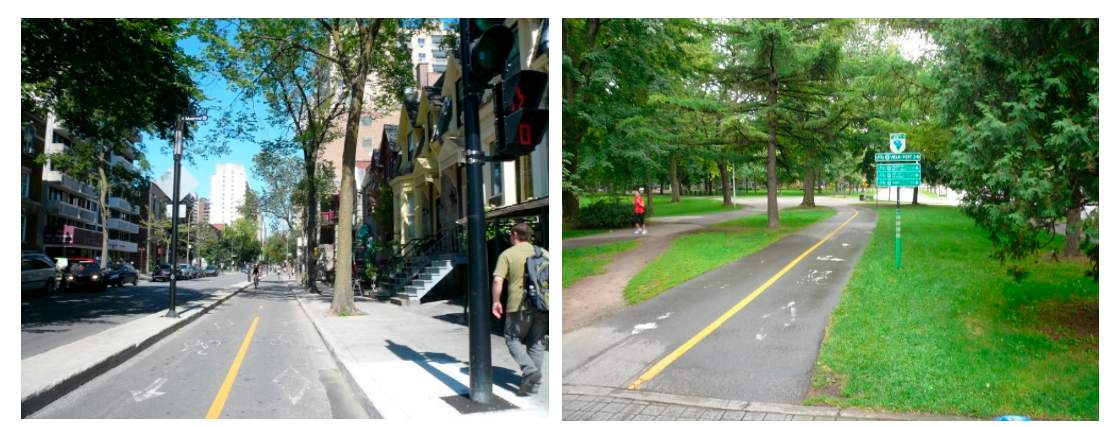
(5) Two-way cycle track