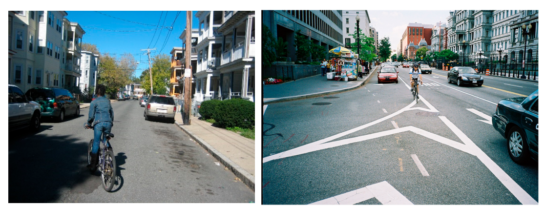
(1) Road—no bike provision