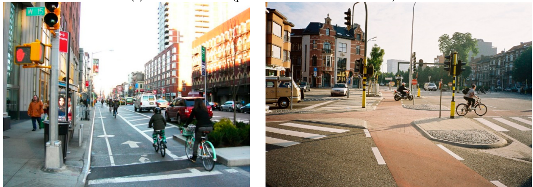
(4) One-way cycle track (photo credit Nate Lusk first picture-photo credit Anne Lusk second)