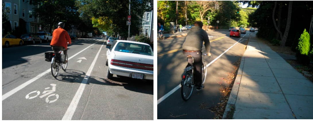
(3) Painted bike lane