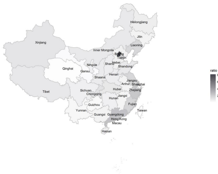
Figure 2. Geographic distribution of users with depression.