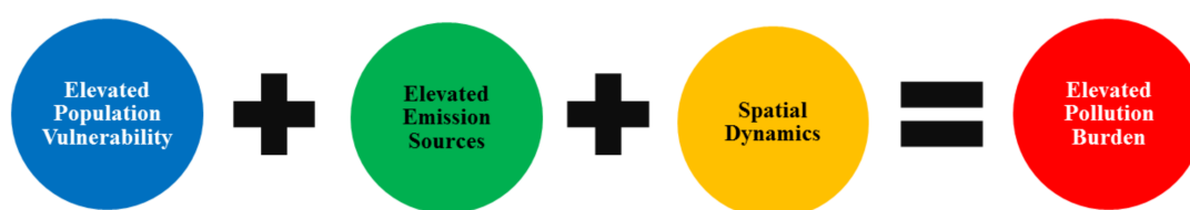
Figure 3. Conceptual framework for modeling the factors that predict adjusted cumulative pollution burden patterns.