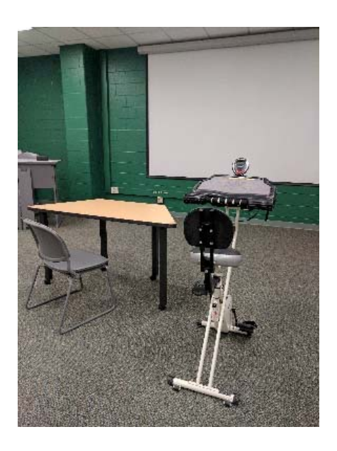
Figure 1. Traditional chair and desk compared to stationary cycle desk (FitDesk, FD Products, Kernersville, NC, USA) in the college lecture classroom.

Stationary cycle desks (FitDesks<sup>®</sup>, FD Products, Kernersville, NC, USA) were randomly placed throughout a lecture classroom to minimize the effect of seating location on learning and attention [16,17]. The traditional desks were standard tables and chairs used in the classroom (Figure 1).