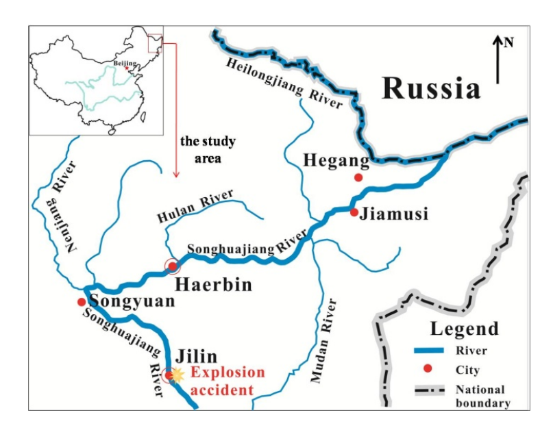
Figure 2. Map of the polluted area in the Songhuajiang River pollution accident.

In 13 November 2005, a major surface water accident happened in China as a result of an explosion at the biphenyl production workshop of Jilin Petrochemical Company, one of branches of Petro China, in Jilin City, Jilin Province, (Figure 2). The accident caused one hundred tones of benzene and related compounds to pour into the Songhuajiang River. The pollutants flowed along the river and formed a 1200-kilometer-long pollution zone crossing two Chinese provinces: Jilin and Heilongjiang (Figure 2). Pollutant concentrations exceeding the thresholds regulated in the environmental quality standards for surface water lasted for 42 days [34]. Water supplies in downstream cities: Songyuan, Haerbin, Hegang, Jiamusi (Figure 2), were all suspended for 3–4 days. Residents affected by the accident were as many as twenty million. Besides, the pollution plume crossed the national border and engendered negative consequences in Russia too. Due to the unavailability of relevant information, the estimation of economic losses in Russia due to the accident were not included in this paper.