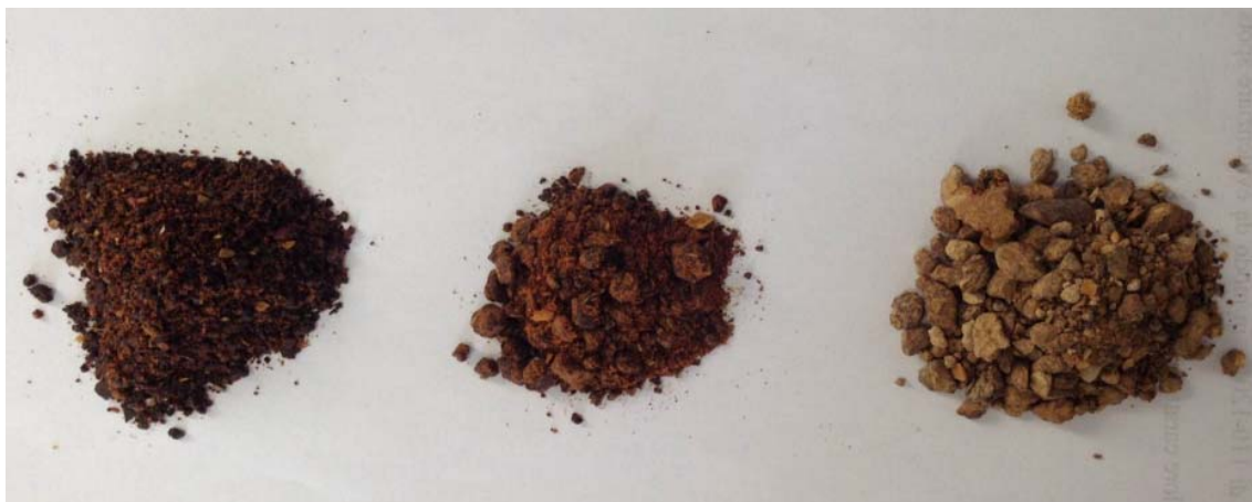
Figure 1. Samples of commercial neem cakes. NCE was obtained from the product in the middle.

extraction of the dried neem cake with ethyl acetate (1:10 wt/v) at room temperature for 24 h [17]. Thereafter the resulted NCE was dried and kept at -4\text{ }^{\circ}\text{C} until further uses.