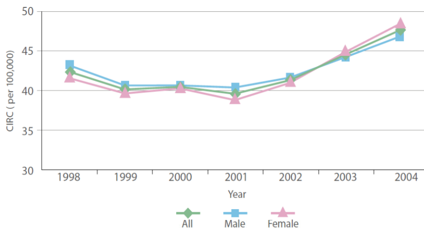
Figure 2. Crude incidence rate (CIR) of all cancers by year.

The association between the mean tropospheric NO 2 and the number and incidence rates of the most common cancers in Saudi Arabia at the region, governorate and city levels were examined using OLS and GWR. A significant association was found, but substantially smaller and less robust associations were also observed. It was found that the number of cancer cases has strong associations with CIR ( r^2 = 0.80, 0.73 and 0.84 for all cases, males and females respectively) and ASR ( r^2 = 0.76, 0.64 and 0.80 for all cases, males and females respectively). This justifies the use of the number of cancer cases