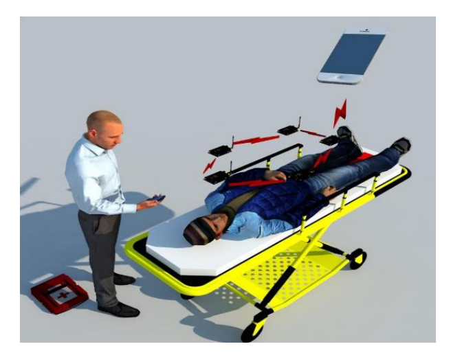
Figure 2. Wireless body sensor network communicating through a mobile phone.

In emergency situations, the integration of a WBSN and a smartphone can enhance the existing medical emergency procedures and minimize the possibilities of permanent injury or death. A basic WBSN-technology implemented in an emergency scenario is shown in Figure 2. It shows a body sensor network where a paramedic is connecting a patient. Sensors will communicate wirelessly to the mobile device and the mobile will capture parameters for subsequent delivery to the servers. Mobile networks help to reduce time and facilitate decision making in these circumstances.