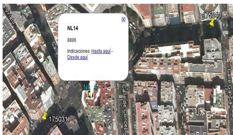
Figure 7. Result after applying a second iteration of the method to the cluster shown in Figures 5 and 6. The method obtains three clusters, two associated with the stops and another one associated with the singular point, which is a roundabout. As the scatter of the clusters is less than 15 m, the identification process is considered to be complete.

Figure 6. Close-up aerial view of the same cluster presented in Figure 5. Result of the first iteration of the method. Tags 175031 and 175041 are scheduled stop points, and tag NL14 is the centroid obtained in the first iteration of the method. The readings have been grouped in a single cluster because there is a roundabout between the two scheduled stop points where the vehicle stops.