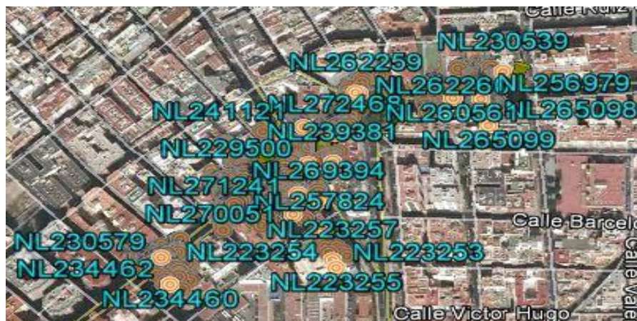
Figure 5. Cluster of type G3. The orange markings are position readings of the vehicle with a velocity of zero. There are two scheduled stop points in the area shown; however, all the readings have been grouped into one cluster, with a centroid at a distance of more than 15 m from the two scheduled stops.

For each cluster of type G3, a new iteration is performed, and each time, the K-means algorithm restricted to the points assigned to the cluster being studied is applied, taking as an initial approximation in the second and following iterations the points of type PP that are known, that belong to the cluster and the centroid of the cluster obtained. Thus, the points will be grouped on the new centroids, each of which is located around the PP and SP points of the cluster. The operation must be reiterated until a result is obtained for which the points are grouped at short distances from the centroids of their cluster. If the centroid of one of these clusters is very close (less than 15 m) to a point known as being of type PP, then the cluster represents readings of type PP. In contrast, if the centroid is not close to a point