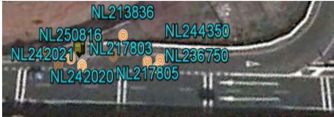
Figure 4. Aerial view of a type G2 cluster. The orange markings represent position readings of the vehicle with zero velocity at a location where no stop is programmed. The vehicle stops because it reaches a road with greater circulation priority. The yellow marking is the centroid of the cluster.