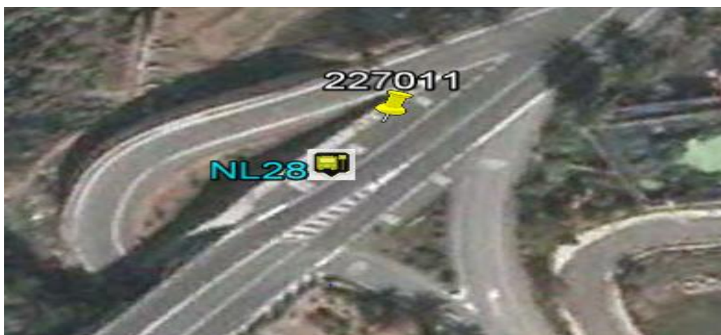
Figure 3. Aerial view of a cluster of type G1. Tag NL28 represents the centroid of the group of readings obtained when the vehicle stopped. Tag 227011 represents the position of the stop.