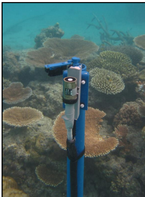
Figure 5. Light Meter installed showing the wiper system in-place.

To measure the effectiveness of the wiper the relationship between the above water sensor (which does not foul in the same way) and the underwater light meters was analyzed. The deployment of two underwater sensors along with a depth sensor means that changes due to water quality and depth can be removed so that any changes in response between the above and in-water sensors can be attributed to bio-fouling. This is not as simple as it sounds, as there can be other factors, but over periods of days and weeks this design will indicate any change in this relationship and hence the degradation in the underwater sensors.