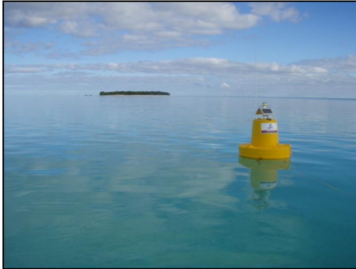
Figure 2. Photograph of a sensor-buoy at Heron Island, southern Great Barrier Reef.