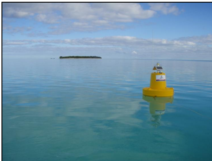
Figure 2. Photograph of a sensor-buoy at Heron Island, southern Great Barrier Reef.