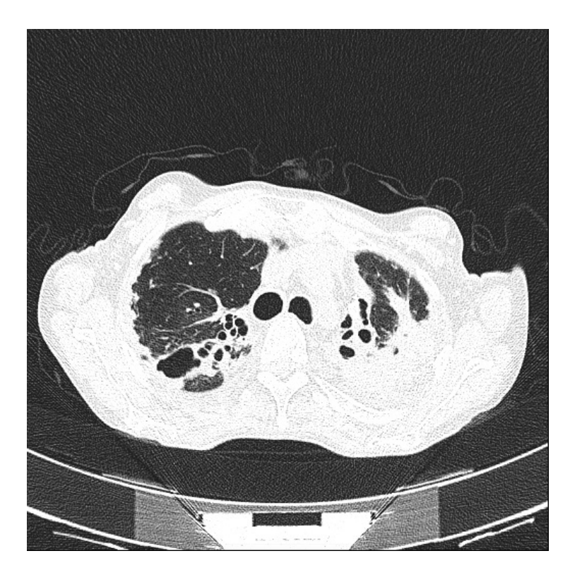
Figure 1. Advanced pulmonary tuberculosis in a patient with rheumatoid arthritis.

and nontuberculous mycobacteria. Therefore, close monitoring during the treatment course is advisable [42,43].