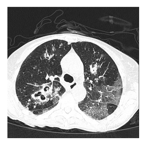
Figure 2. Pulmonary invasive Aspergillosis in a patient with anti-neutrophil cytoplasmic antibody (ANCA)-associated vasculitis.