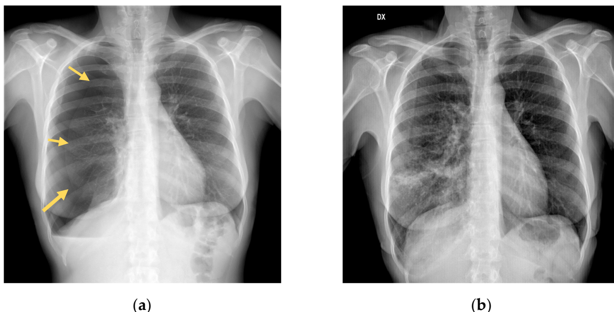
Figure 1. (a) Initial chest X-ray shows a right pneumothorax of 55 mm (The arrows mark the right lung border along the pleural line). (b) Chest X-ray evaluation, after needle aspiration, shows expansion of the lung parenchyma with a reduction in pneumothorax size.

showed complete resolution of the pneumothorax flap. As a result of our case report, we thought it would be helpful to provide a review of the current evidence related to conservative treatment for traumatic PTX that should not be considered a clinical guidance document. Rather, it provides the available evidence about clinical practice in the current medical literature addressing some of the variation that may exist in the management of traumatic pneumothorax.