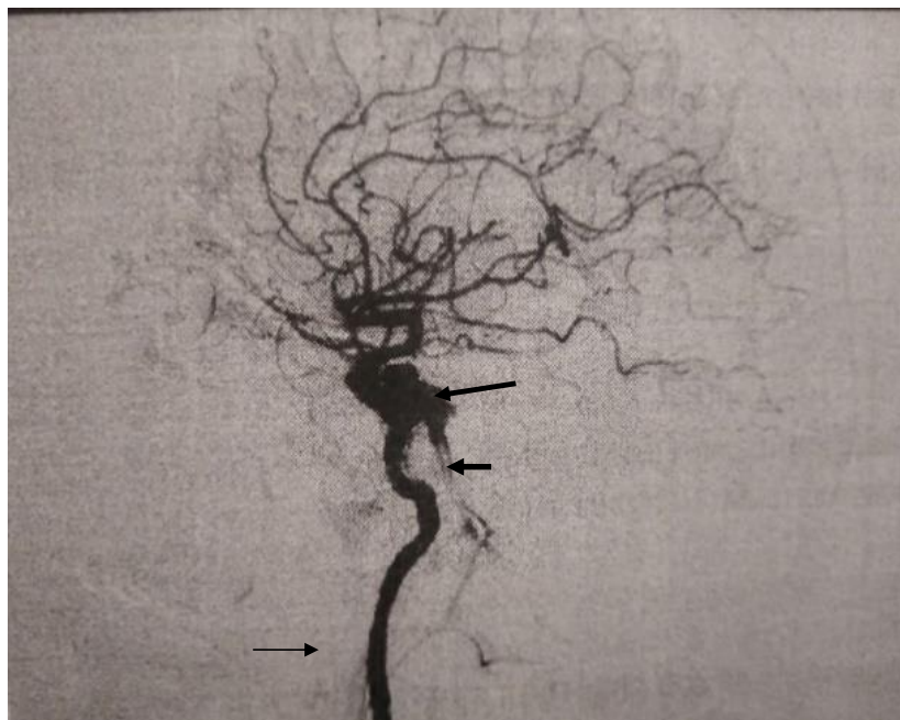
Figure 1. Digital Subtraction Angiography (DSA) finding before the spontaneous occlusion demonstrating carotid-cavernous fistula (long arrow) with enlarged vein (short arrow). Right internal carotid artery (thin arrow).